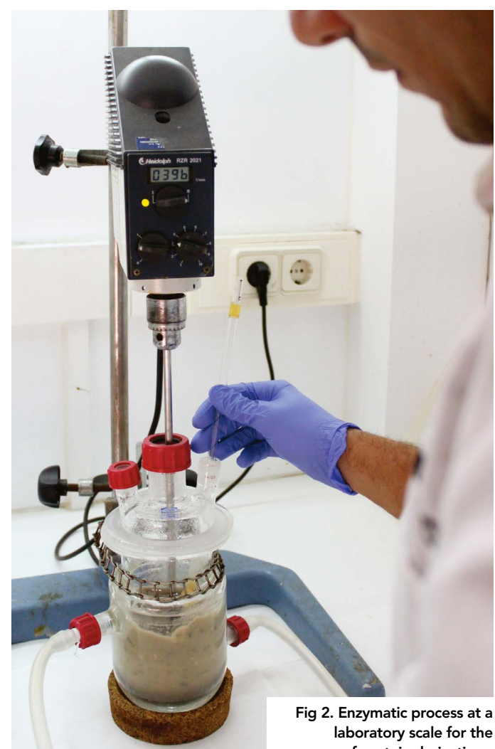
recovery of protein derivatives.