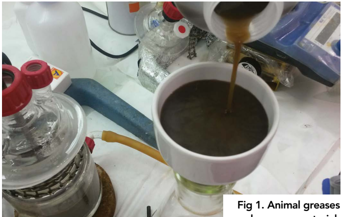
used as a raw material.

According to the European Fats Processing and Renderers Association (EFPRA), 328 million farm animals (mainly cattle,